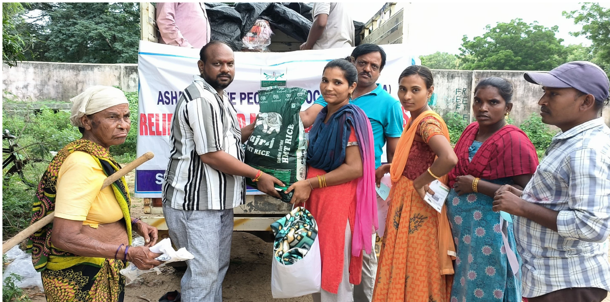
Flood Relief Activities in Khammam district, supported by the CSR unit of MassMutual India