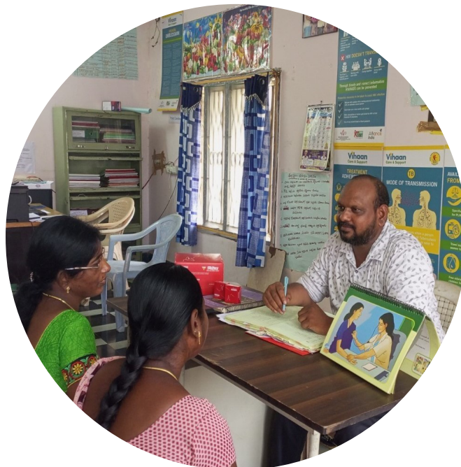
Counselling session at APPA+ office

In addition to health, we also focus on the socio-economic development by facilitating access to social entitlements, social welfare schemes and legal aid support. Gradually, we also extended our services to the PLHIV community in the Bhadradri Kothagudem district and Adilabad district.