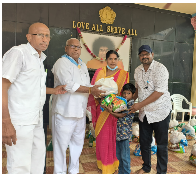
Satya Sai Trust distributed Nutrition to PLHIVs

In January 2024, team from CSU United States visited our office and discussed about the issues of the community and the services offered by APPA+. The interaction concluded with CSU agreeing to provide lifelong nutrition support to the marginalized PLHIV and free health check-ups in their hospital.