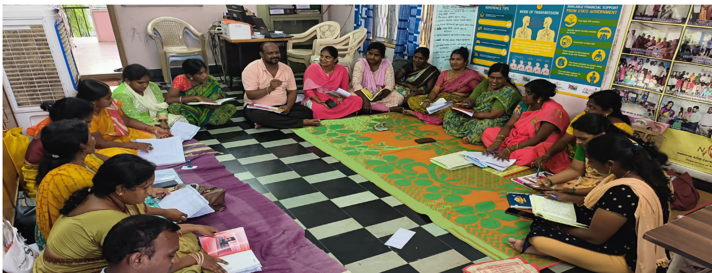
Monthly review meeting with staff

PLHIV and their families availed Social Welfare and Protection Schemes