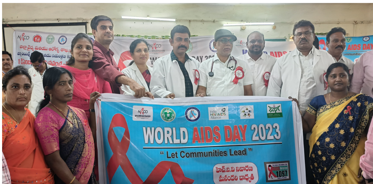
Team participates in the celebration of World AIDS Day, 2023