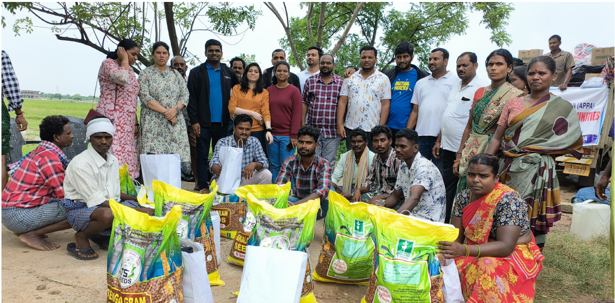
Flood Relief Activities in Khammam district, supported by the CSR unit of MassMutual India