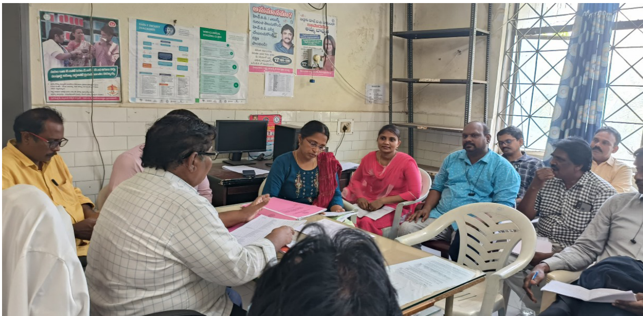
APPA+ team interacts with the Senior Medical Officer, ART Center, Khammam