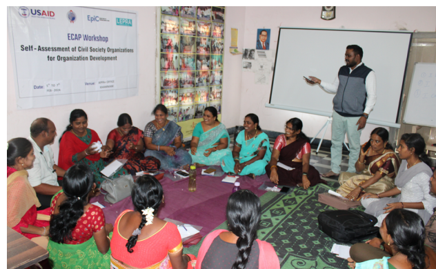
Baseline Assessment of APPA+ being conducted by LEPRA team under the EpiC Project

A Capacity Development Plan (CDP), prioritized by a participatory process, shall be made in consultation with the EpiC team. The identified priority areas shall be strengthened through workshops and mentoring visits conducted by the EpiC team.