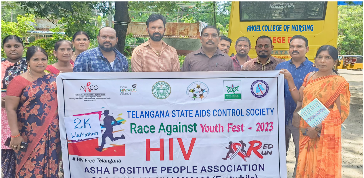
APPA+ participates in the Race against HIV, Youth Festival Walkathon 2023