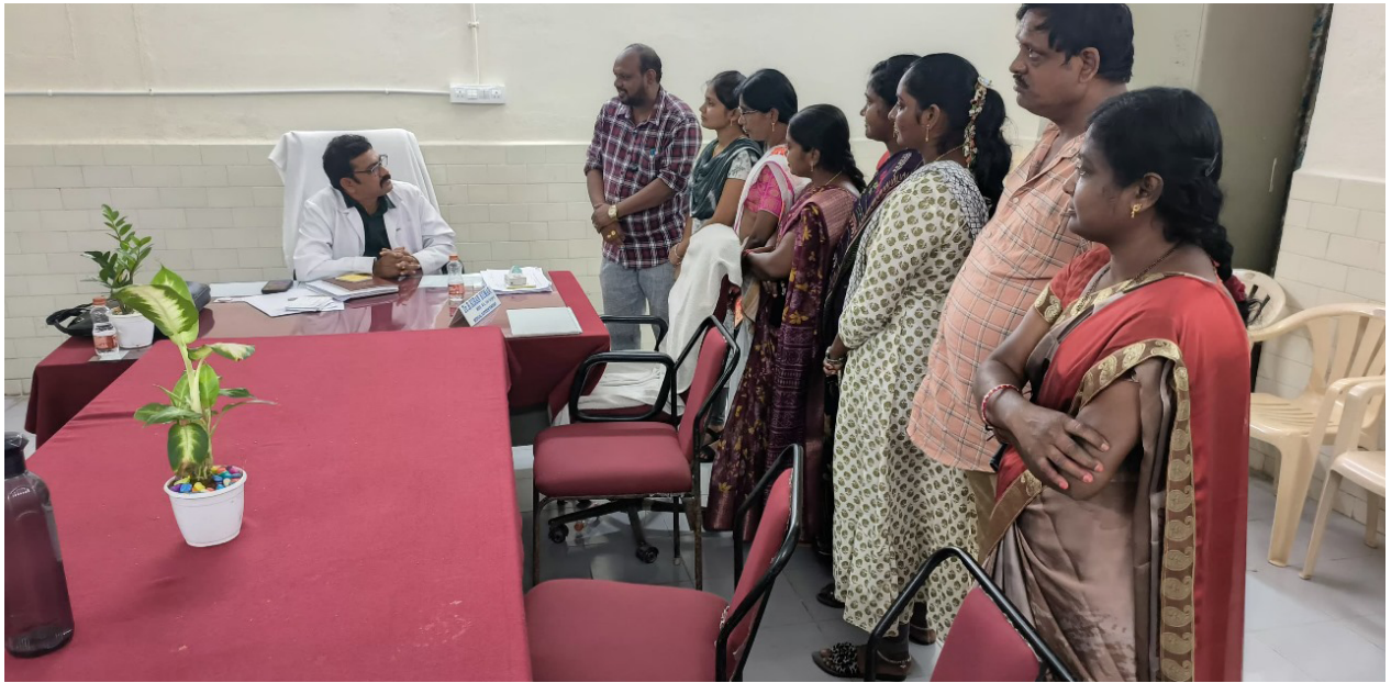
Interaction with the Superintendent of Government General Hospital, Khammam