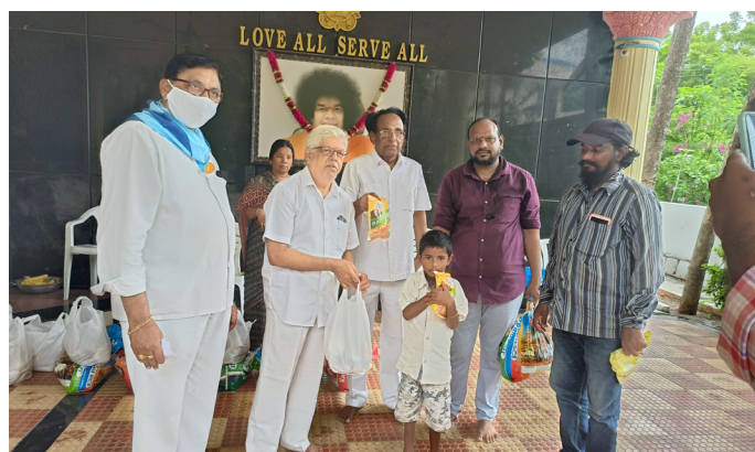
Satya Sai Trust distributed Nutrition to PLHIVs

With support from the Satya Sai Trust, 45 nutrition kits were distributed every month to the PLHIV in Khammam district.