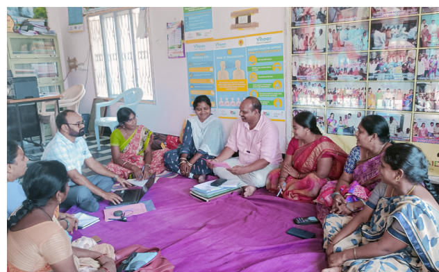
Preparation of Capacity Development Plan for the APPA+ team with the LEPRA team under the EpiC Project