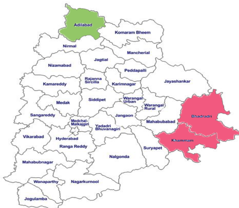
Map of Telangana, India

APPA+ currently operates in 2 districts of Telangana – Khammam and Bhadradri Kothagudem. For a couple of years from 2019-2021, the organization also worked in Adilabad district, providing HIV/AIDS Care and Support Services through the Vihaan CSC initiative to 3500+ PLHIV.