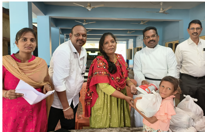
Nutrition support to PLHIV at Bhadrachalam supported by Christen Service Unit

In 2023-24, 664 PLHIV benefitted from the nutrition mobilized by the APPA+ team.